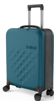
Rollink Flex 360 Spinner Suitcase 21" 127545