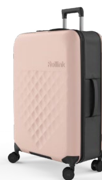
Rollink Flex 360 Spinner Suitcase 29" 127547