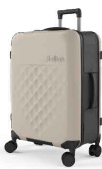
Rollink Flex 360 Spinner Suitcase 26" 127546